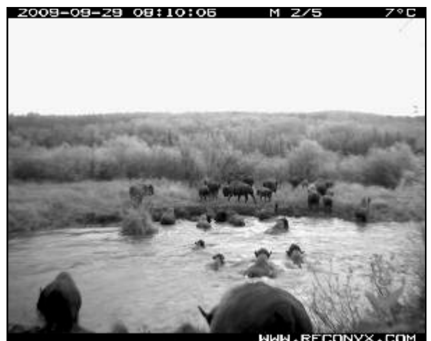
Bison herd crossing the Sturgeon River.

The project will also promote the recognition of bison to local residents, First Nations, and Métis communities. For Saskatchewan as a